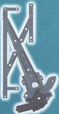
Mabuchi Motor (BEM quality)